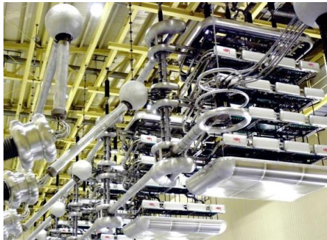
Figure 2 Converter Valve Equipment

The core equipment of converter valve is thyristor. Thyristor is a kind of switching element, which can work under high voltage and high current, and its working process can be controlled. Under the condition of high voltage, when thousands of thyristors are operating at the same time, the electromagnetic interference intensity will be very high, and the trigger pulse in the thyristor trigger system will be impacted by the strong interference, resulting in thyristor mistakenly triggered, not triggered or deteriorated pulse quality, etc. At the same time, the thyristor rectifiers are often under high voltage state with voltage up to thousands of volts. As a low-voltage weak-current system, in order for the trigger control system to operate normally and safely, it is necessary to take corresponding isolation measures for other related components.