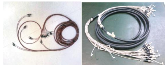
Figure 3 Physical Object of Trigger Optical Cable Assembly